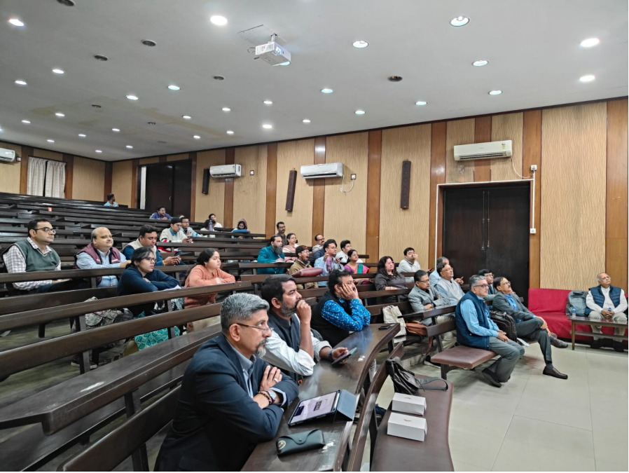
Caption: Speakers and Participants of the symposium