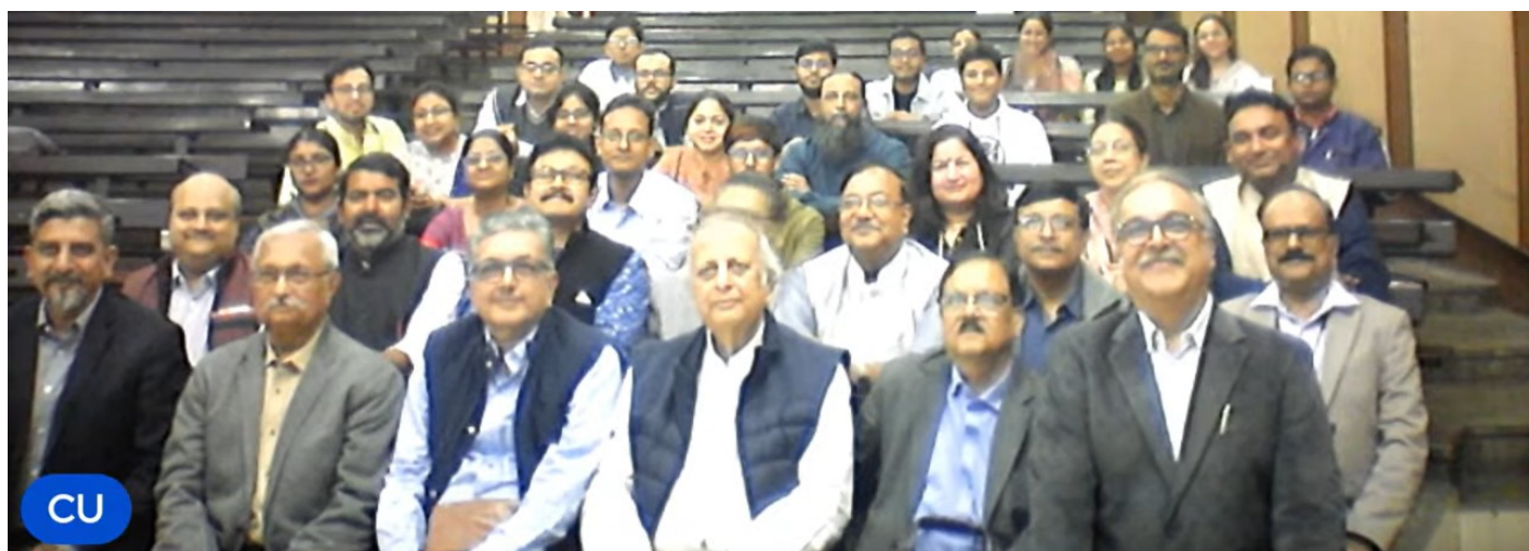
Photo picture(s) – jpeg (with captions): please refer the subsequent pages containing additional event photographs and captions.