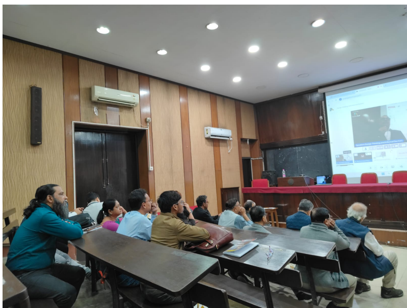
Caption: Speakers and Participants (in person and virtual) of the symposium.